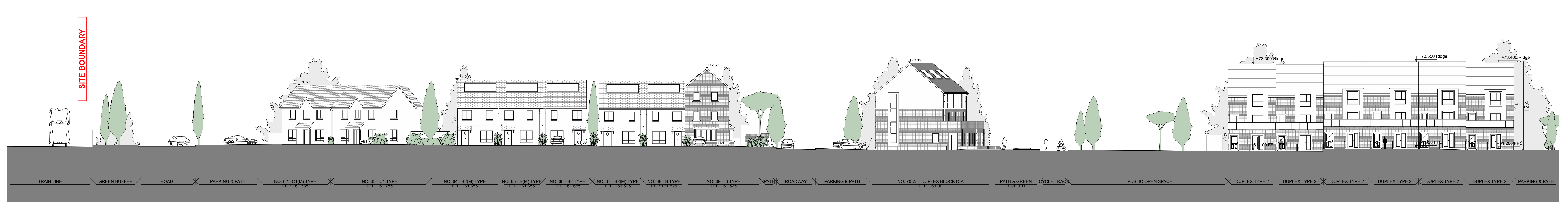
1:200 Section A - A S-01