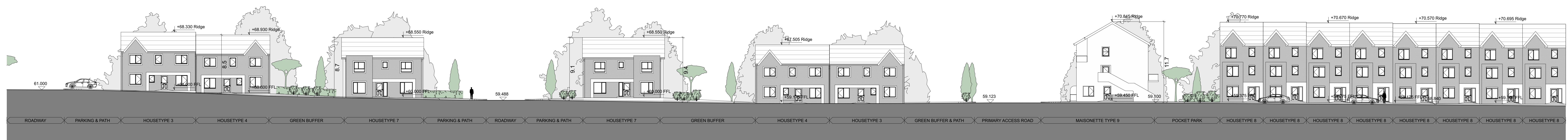
1:200 Section A - A S-02