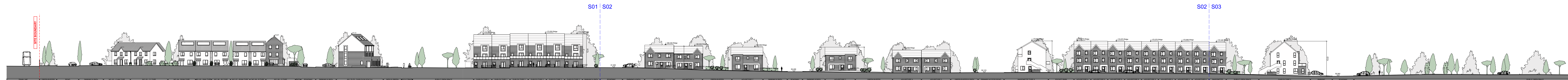
1:500 Section A - A